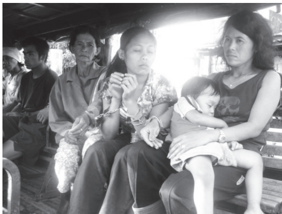
Farmers, including 2 minors, were illegally arrested and accused of being members of the NPA.