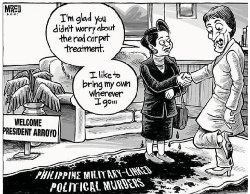
Moreu on Arroyo The Press Editorial Cartoon, 29 May 2007 http://www.stuff.co.nz/thepress/293795a21498.html

Secretary, Philippines Solidarity Network of Aotearoa Box 2450, Christchurch, New Zealand cafca@chch.planet.org.nz * www.converge.org.nz/psna