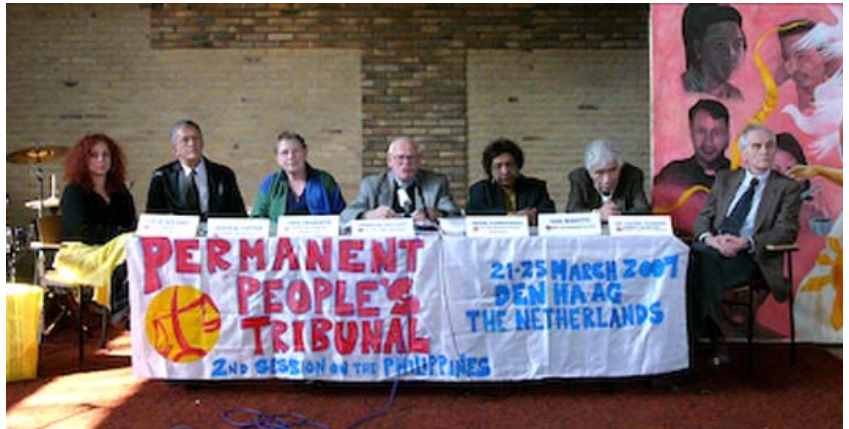
GUILTY! The PPT jurors at the verdict.

Hustisya and Desaparecidos members said: "We are