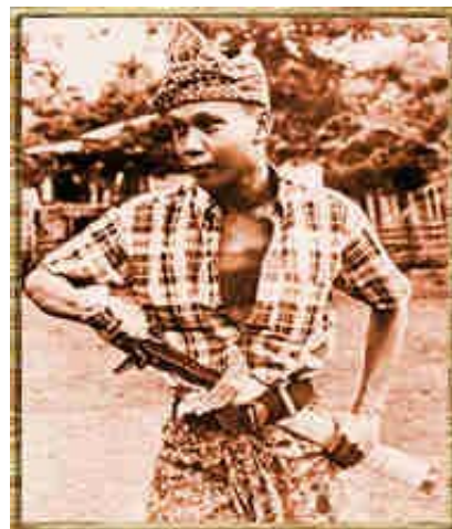
A Tausug warrior and his kris.

The Tausugs built their trenches in the crater on top of Bud (mountain) Dahu, an extinct volcano with an altitude of 2,100 feet. Against some 1,000 Moros armed with kris , spears and rocks, Gen. Wood sent 790 rifle-armed soldiers, backed up by artillery such as canons, heavy mountain guns and machine guns fired from the gunboat Pampang . Still, the unwavering Moros proved to be one of America's bravest