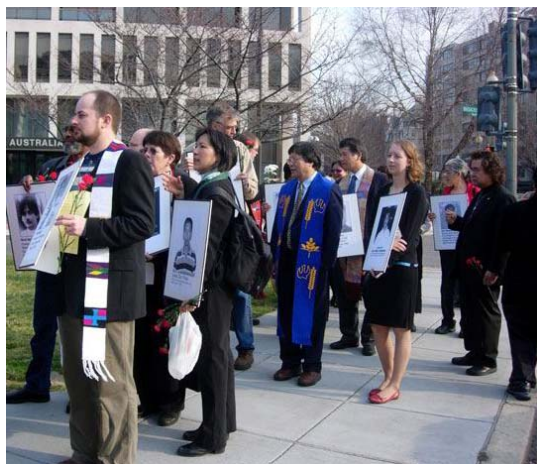
The Ecumenical Voice for Peace and Human Rights in the Philippines lent their support to the US Senate hearing on the extrajudicial killings. The church people marched to the Philippine Embassy in Washington, and had a brief worship service in front of National City Christian Church.

The Democrat senator from California said U.S. military assistance to the Philippines should not be used for extrajudicial killing and proposed "to tie some strings around military aid." FHR